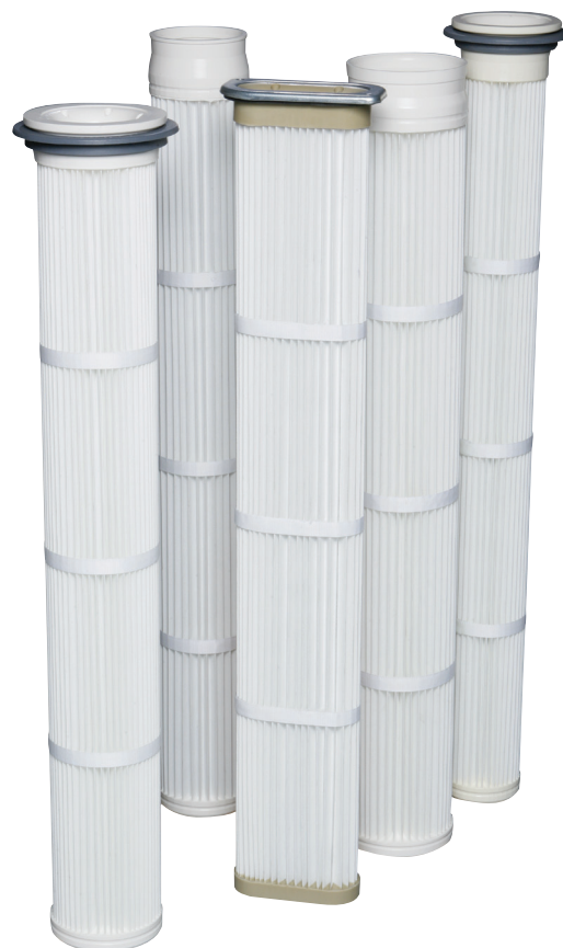
TORIT TEX PLEATED BAG FILTERS

Available for all popular brands of baghouse collectors