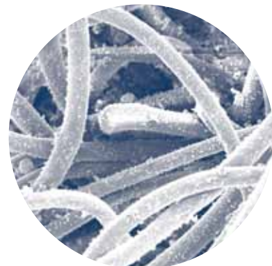
Polyester Bag–Clean Air Side (300x)